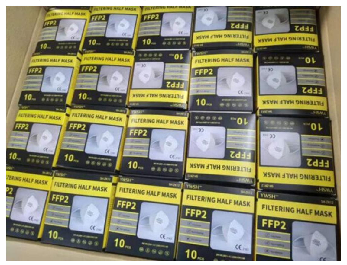
FFP2 Mask is hot in German.

locate it uneasy to breath in and also specific clients with respiratory conditions may not have the ability to wear this. Nonetheless, these kinds of masks are still exceptional selections to use in public, especially if you are mosting likely to see risky areas or at-risk individuals.